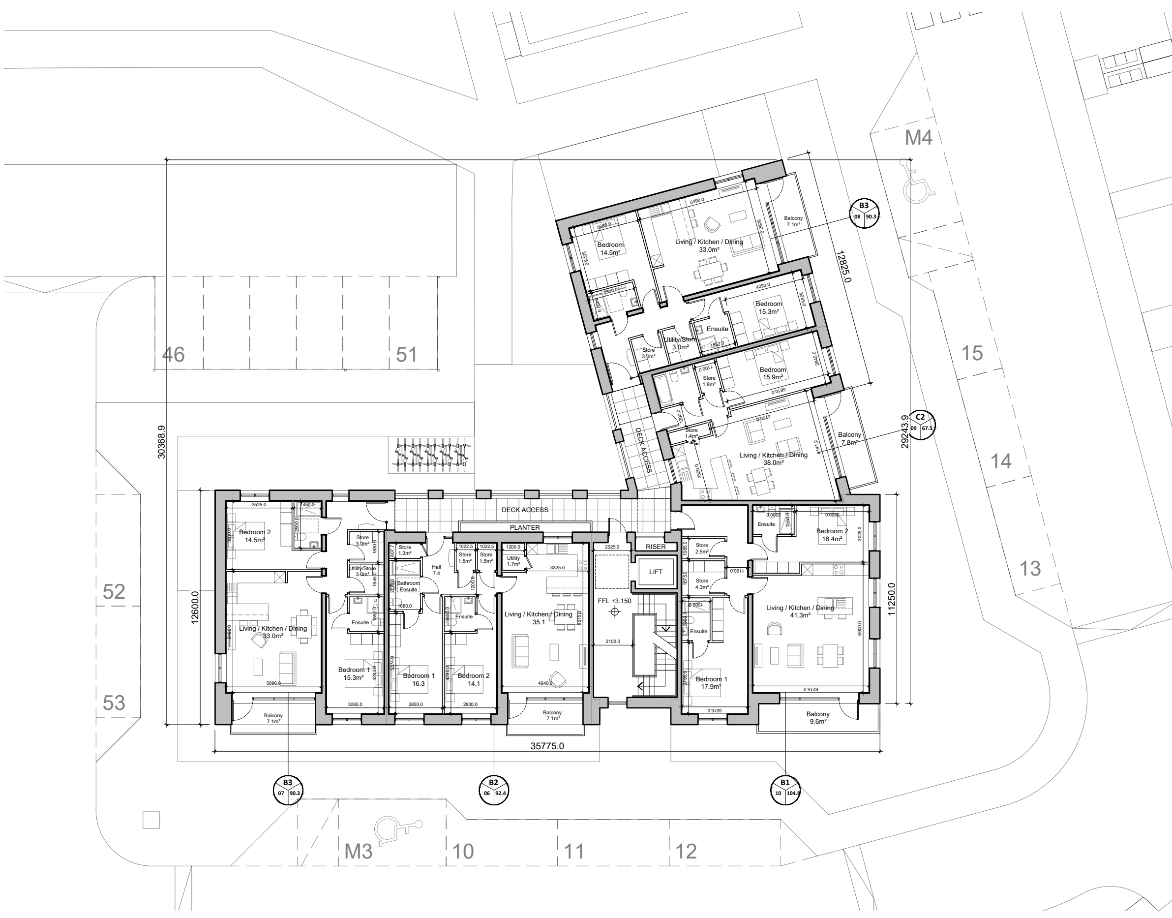
Apartment Block 02 - First Floor Plan Scale 1:200